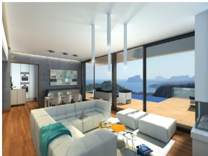
Modern living room with views to the sea