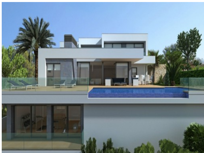
Front view of the villa with infinity pool