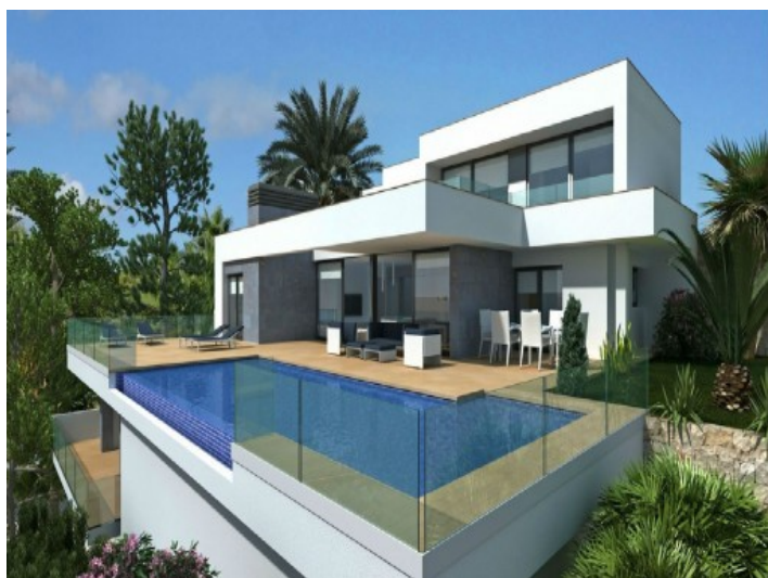
Large terrace with pool