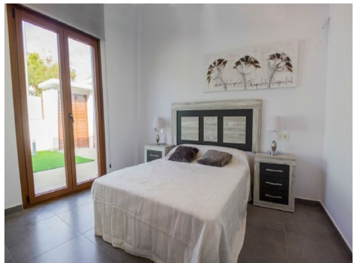
1 of 3 bedrooms