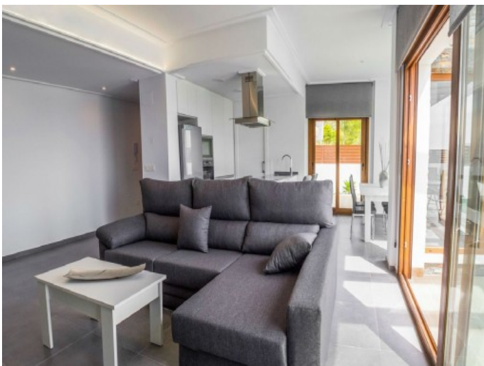
Cosy sitting area