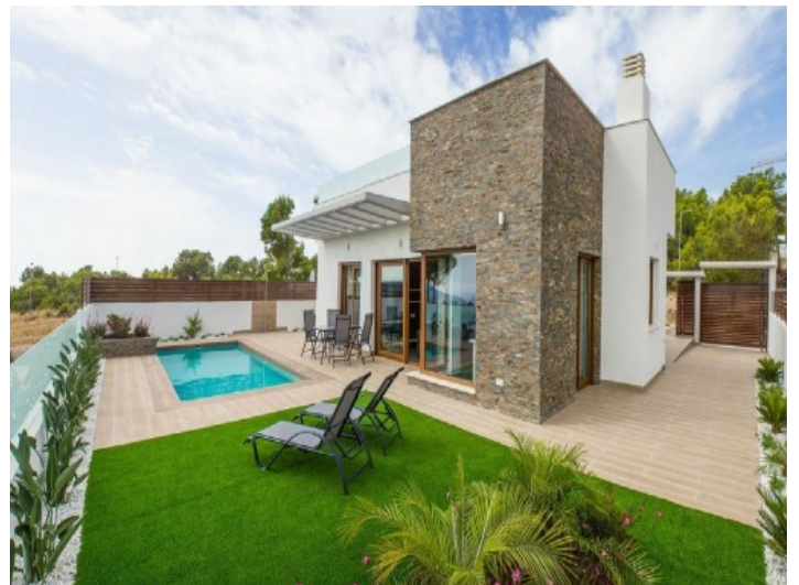
Terrace with pool

All information is correct to the best of our knowledge. Errors and prior sale excepted. This prospectus is purely for information purposes. Only the notarized deed of sale is legally binding.