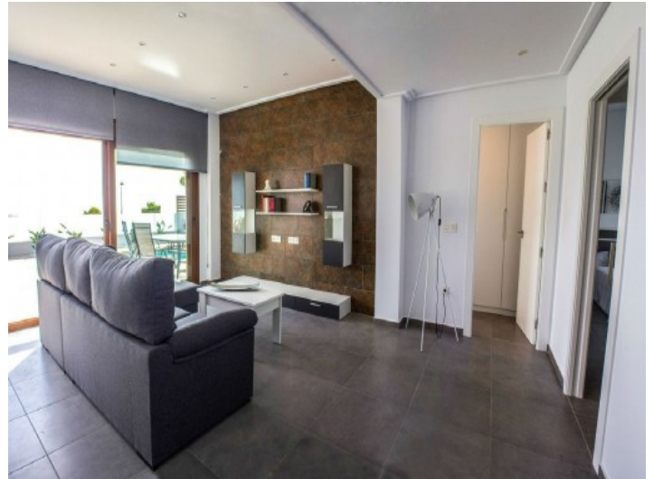
Modern living room