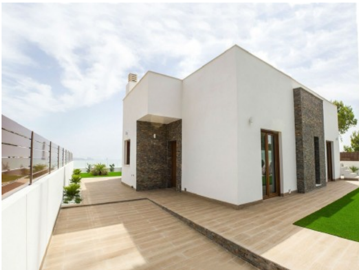
Entrance to the villa