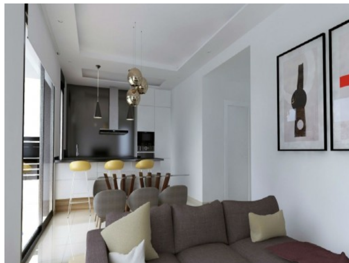
Living room design