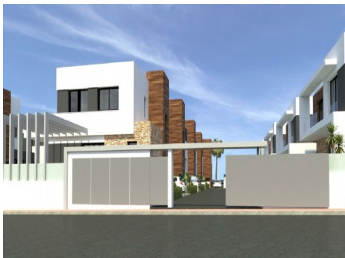
Front view of the villa

All information is correct to the best of our knowledge. Errors and prior sale excepted. This prospectus is purely for information purposes. Only the notarized deed of sale is legally binding.