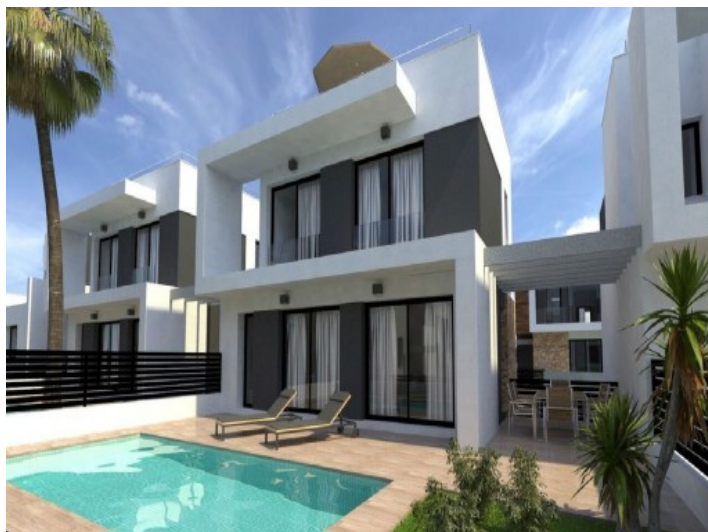
Design of the pool area