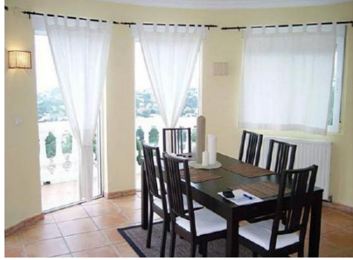
Dining room with views