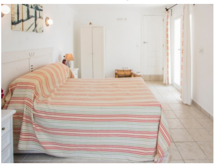
Light-flooded bedroom with double bed