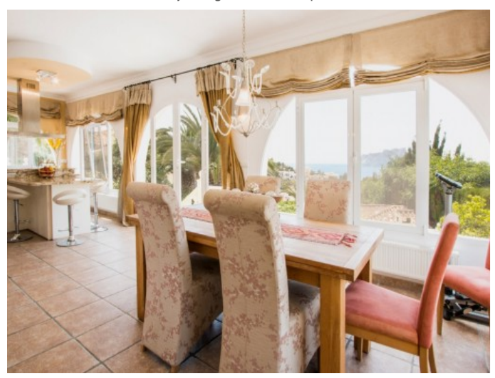
Dining area with view of the sea