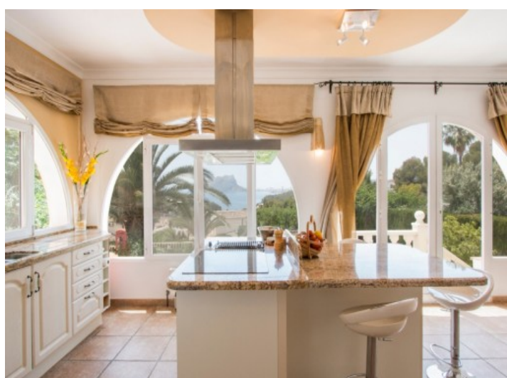
Fully equipped kitchen Capacious bedroom with double bed All information is correct to the best of our knowledge. Errors and prior sale excepted. This prospectus is purely for information purposes. Only the notarized deed of sale is legally binding.

PORTA MONDIAL • C./ COLOM 20, 1°, E-07001 PALMA DE MALLORCA TEL. +34 971 720 164 • INFO@PORTAVALENCIA.COM