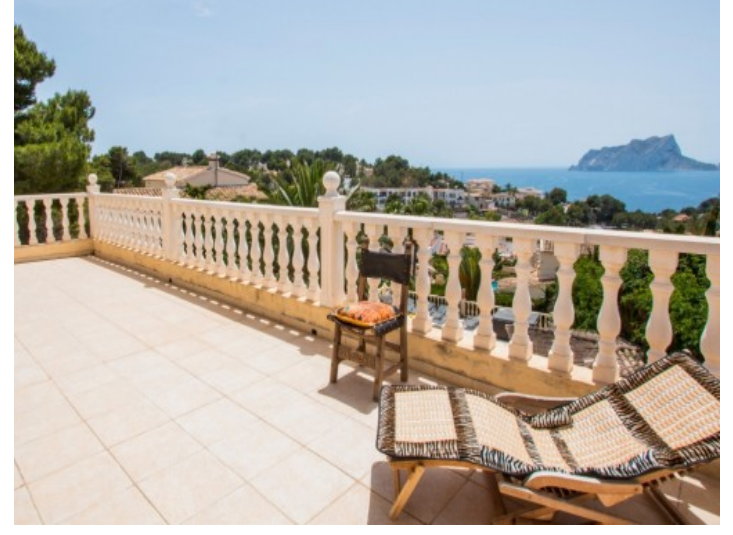
Stunning view of the sea and the surrounding landscape