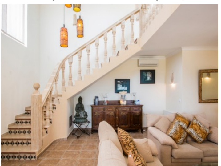
Living room with stairway to the upper floor