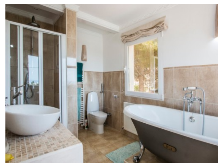
Bathroom with bathtub and daylight