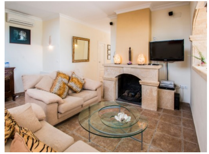
Cozy living area with fireplace