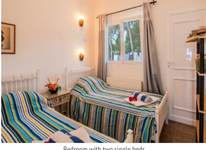
Bedroom with two single beds