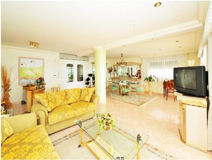
Spacious living-dining area