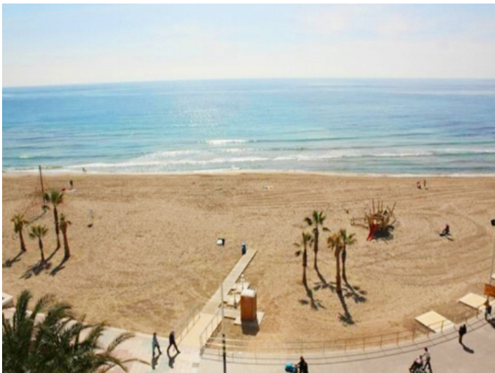
Beach Penyal d'Illac directly in front of the house