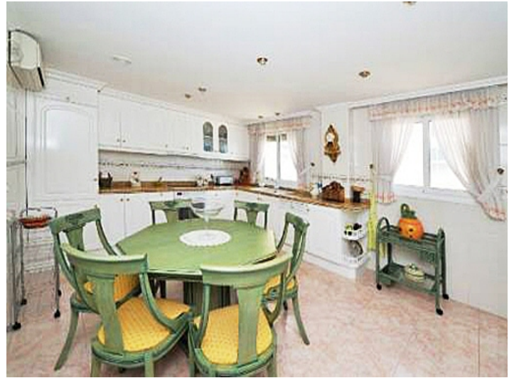
Fitted kitchen with dining area