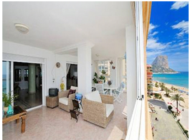
Balcony with sea views