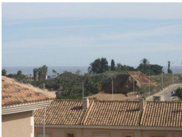
Impressive view of the landscape and the sea

All information is correct to the best of our knowledge. Errors and prior sale excepted. This prospectus is purely for information purposes. Only the notarized deed of sale is legally binding.