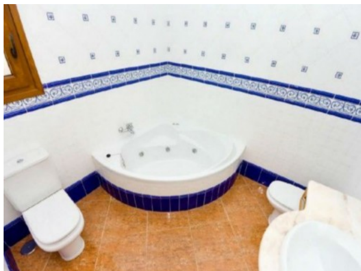
Bathroom with daylight and bathtub

All information is correct to the best of our knowledge. Errors and prior sale excepted. This prospectus is purely for information purposes. Only the notarized deed of sale is legally binding.