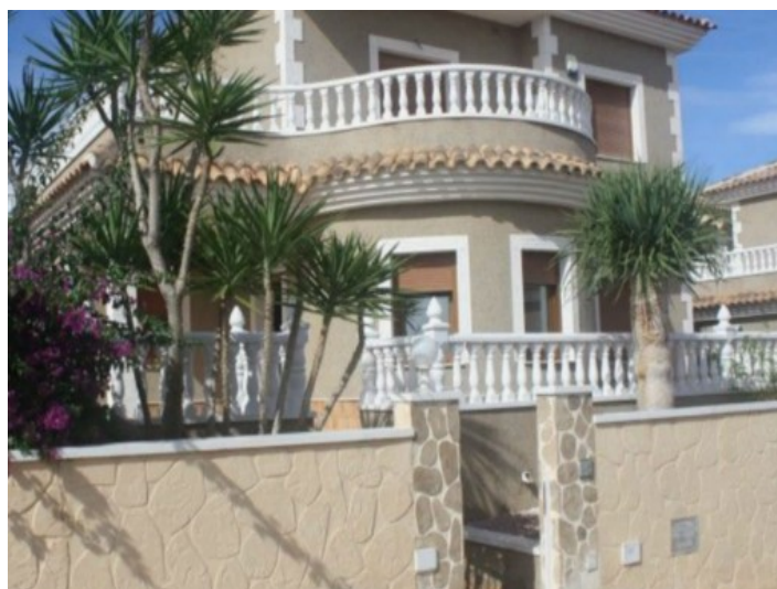
Front view of the enchanting property