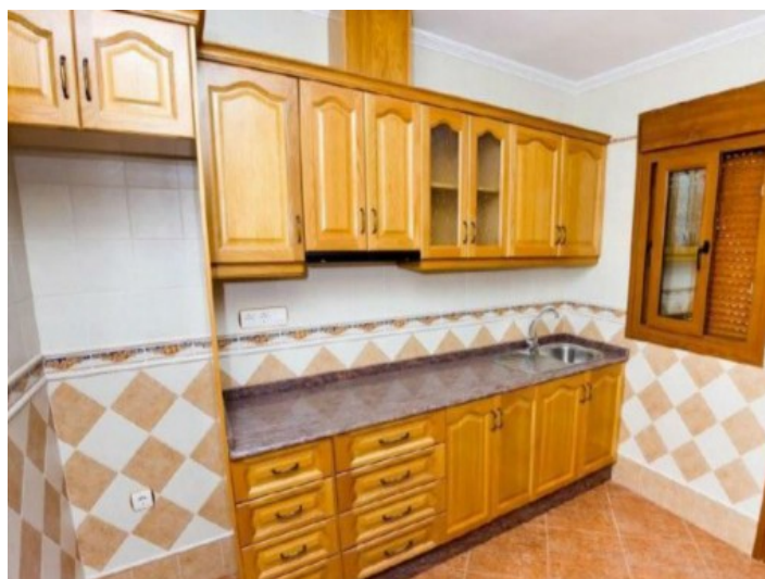
Rustic and fully equipped kitchen