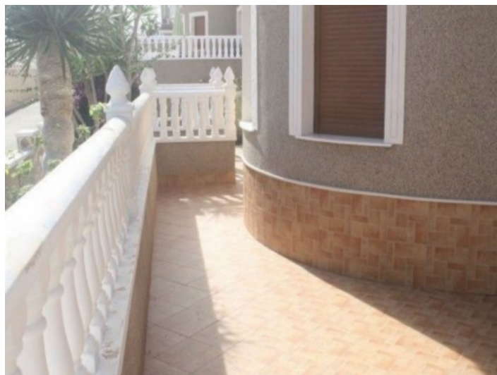
Another terrace of the considerable estate