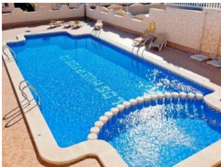
Spacious pool area with sunbeds