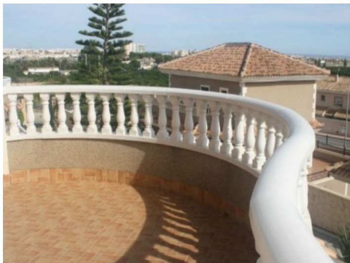
Terrace with stunning views