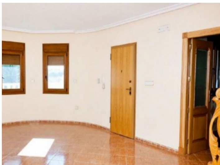
Light-flooded living area