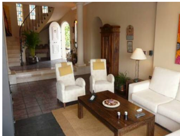
Stylish living room