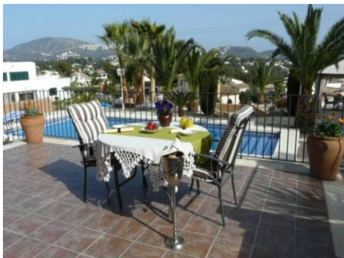
Terrace with pool

All information is correct to the best of our knowledge. Errors and prior sale excepted. This prospectus is purely for information purposes. Only the notarized deed of sale is legally binding.