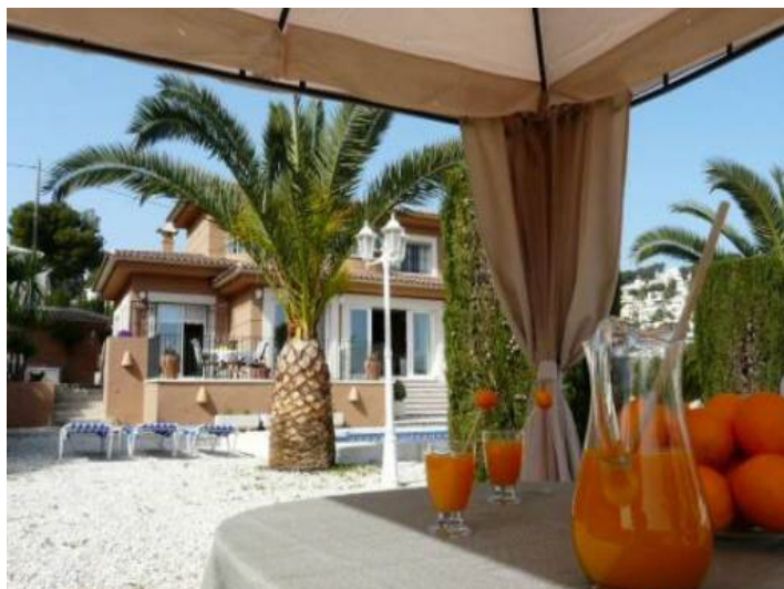
Terrace with view to the villa