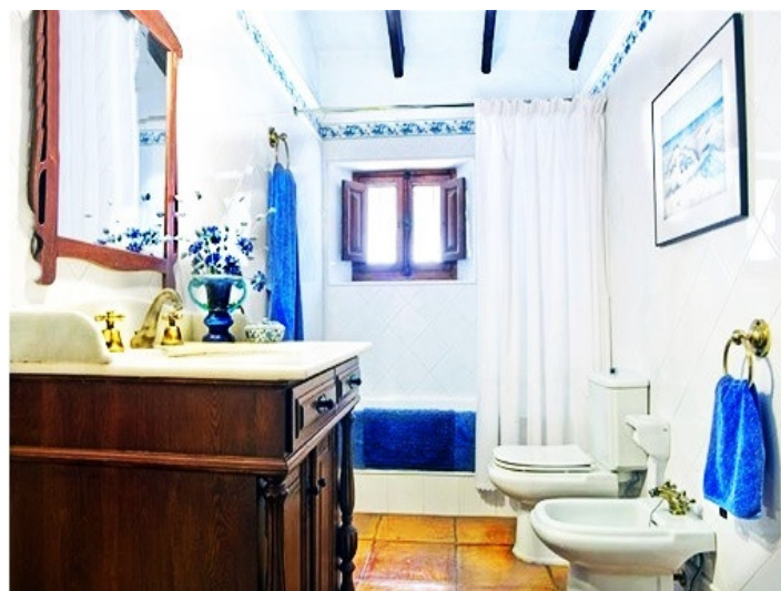
One of the stylish bathrooms