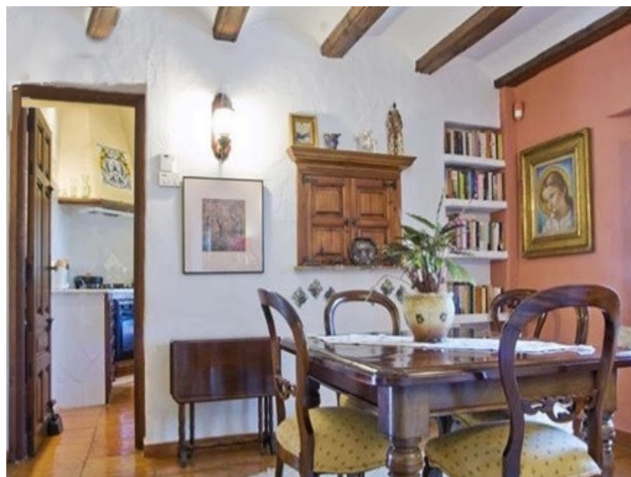
The spectacular dining room