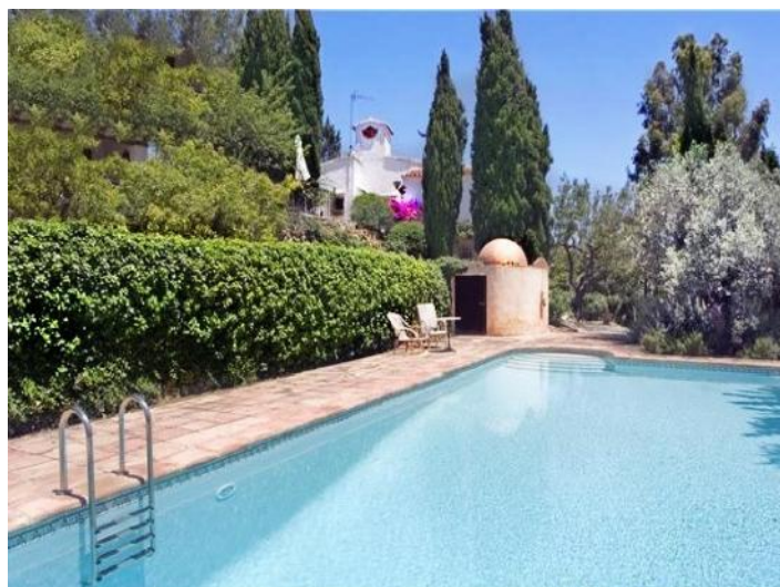
The spacious pool

All information is correct to the best of our knowledge. Errors and prior sale excepted. This prospectus is purely for information purposes. Only the notarized deed of sale is legally binding.