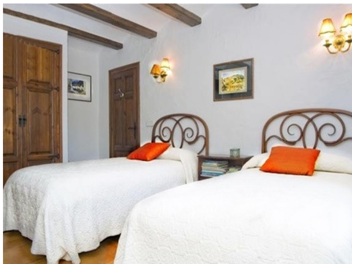
One of the cosy bedrooms