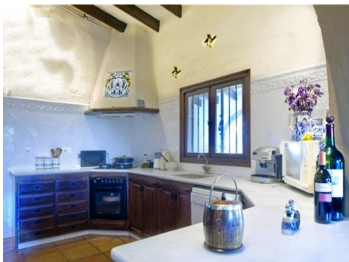
One of the spacious, pleasant kitchens