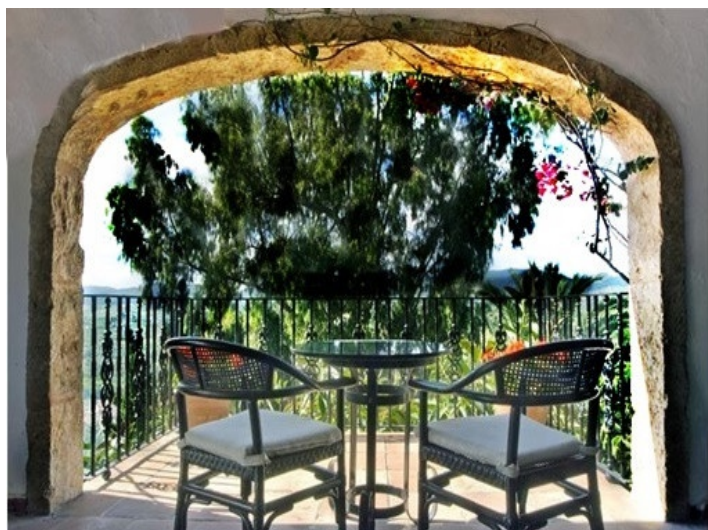
The covered terrace with beautiful views