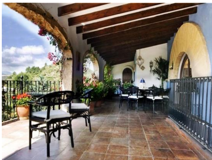
The heavenly terrace