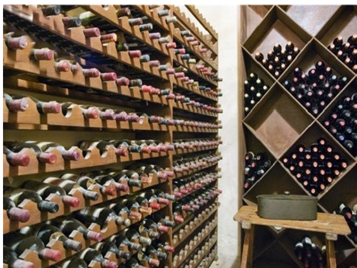
The private bodega

All information is correct to the best of our knowledge. Errors and prior sale excepted. This prospectus is purely for information purposes. Only the notarized deed of sale is legally binding.