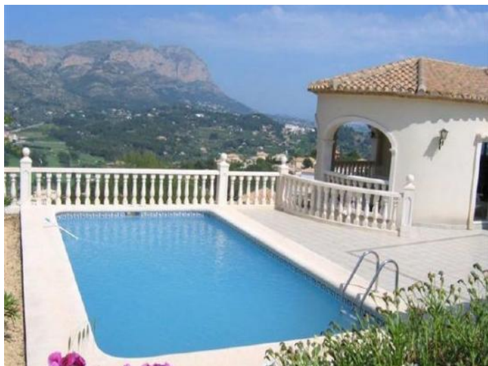
Swimming pool with lovely views