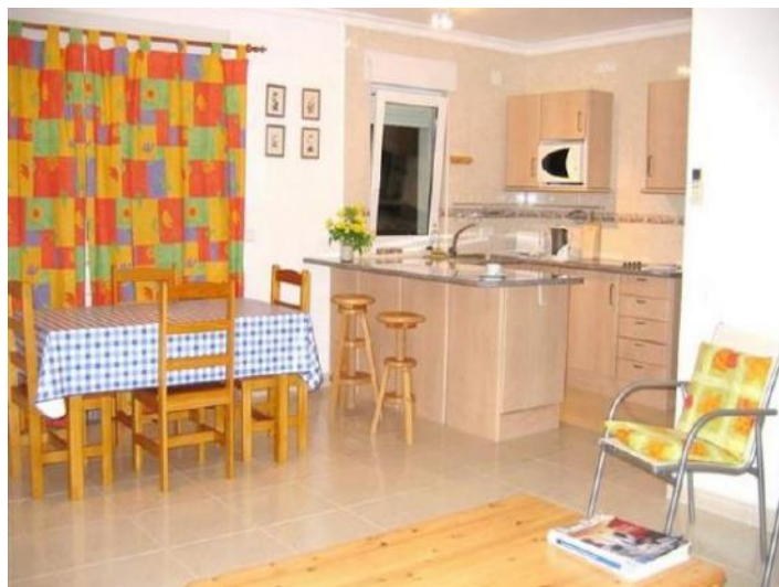
Kitchen with dining area