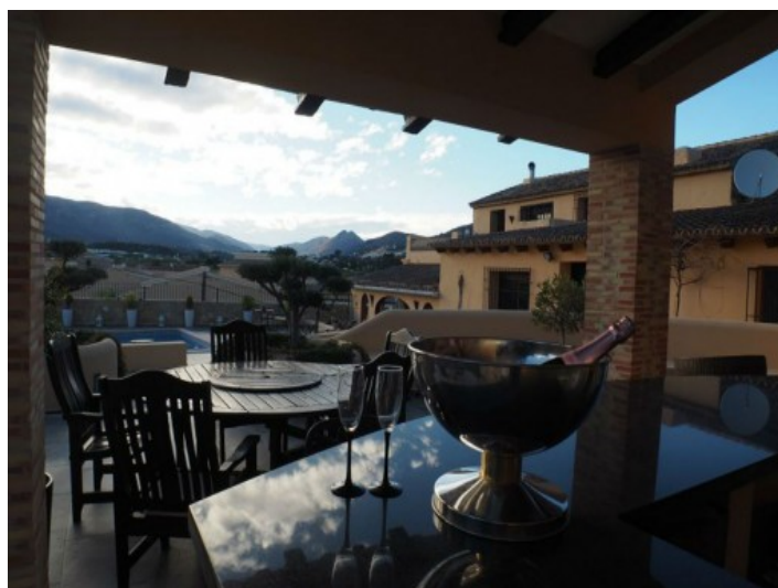
Outside bar area