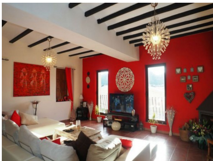
Cosy living room