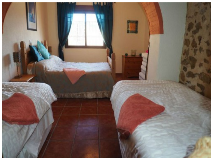
Bedroom with 3 beds

All information is correct to the best of our knowledge. Errors and prior sale excepted. This prospectus is purely for information purposes. Only the notarized deed of sale is legally binding.