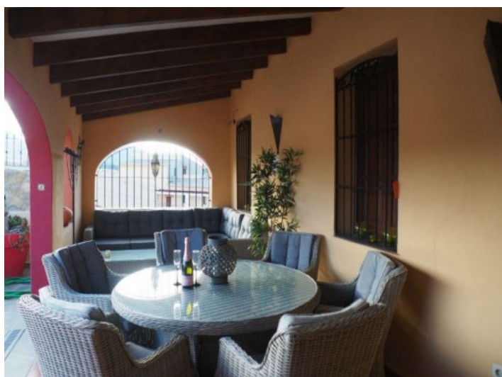
Outside dining area

All information is correct to the best of our knowledge. Errors and prior sale excepted. This prospectus is purely for information purposes. Only the notarized deed of sale is legally binding.