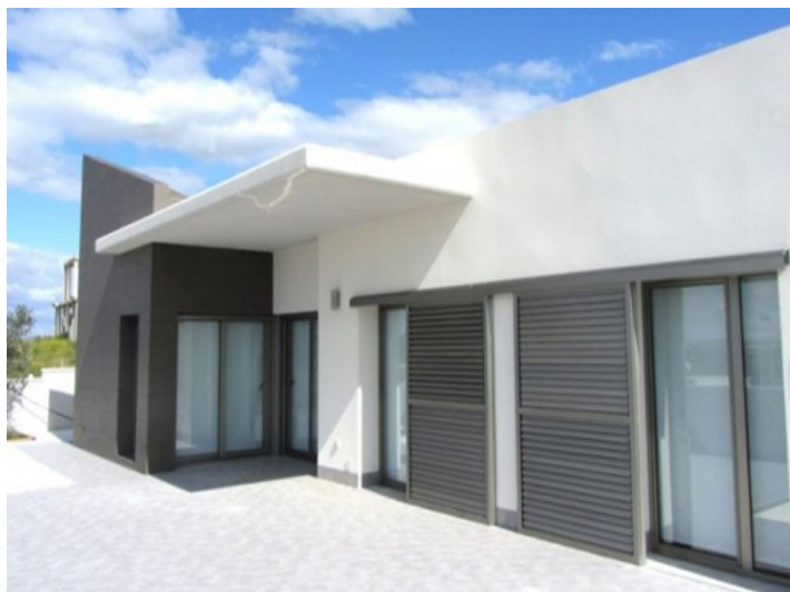
Villa with Pool