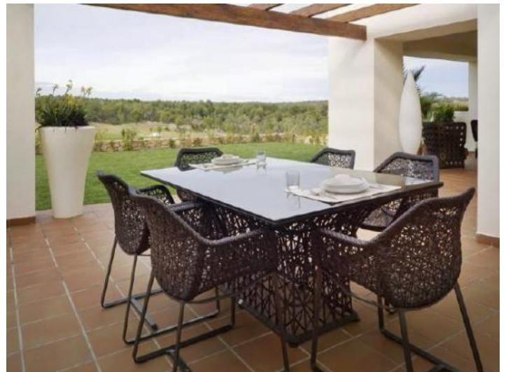
Terrace with view at the golf court