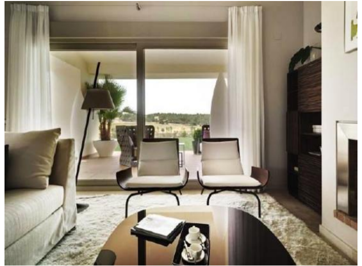
Living area with exit to the balcony