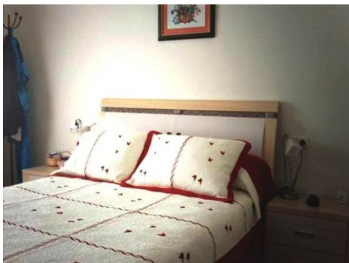
One of the 4 bedrooms